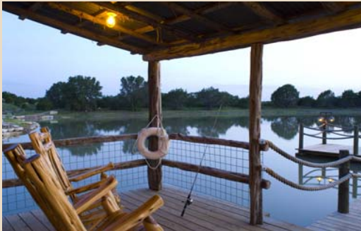
Wally's Bait Shop and Fish Camp

Includes: Two Levels, Three Dining Areas, Media Room, Study/Library, Wine Cellar, 3-Car Garage, Gourmet Kitchen, Guest Suite, Covered Balcony and Three Full Masonry Fireplaces.