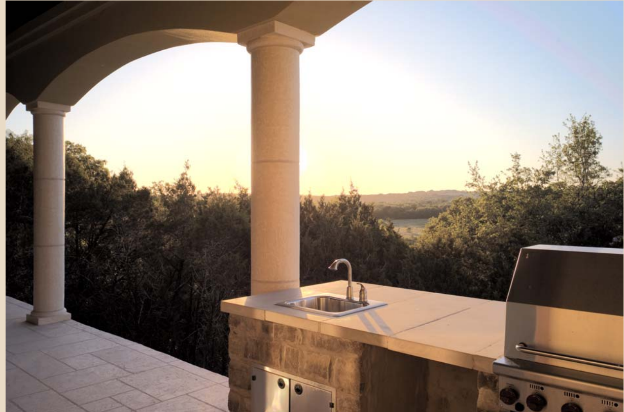
View from Outdoor Living Area